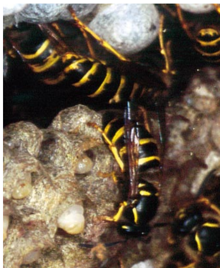
Figure 1 Worker egg-laying in Dolichovespula saxonica . Workers police other workers' reproduction more in colonies where the queen has mated multiple times than in those where she has mated only once.

Kin-selection theory predicts that in social-insect colonies where the queen has mated multiple times, the workers will enforce cooperation by policing each other's reproduction 1-4 . We have discovered a species, the wasp Dolichovespula saxonica ,