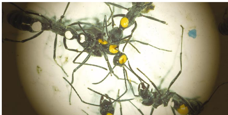
...but this ponerine ant is assaulted by fellow workers as a punishment for attempting to reproduce.

queen is mother to the entire female workforce, they have little to gain by producing their own daughters.