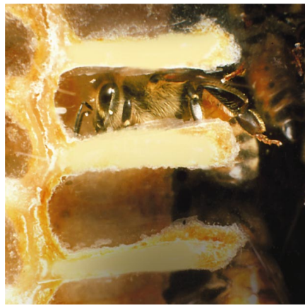
A honeybee kills an a renegade worker's egg, left.

But sometimes policing breaks down. Beehives occasionally dissolve into anarchy, as workers begin to reproduce en masse 5 . And a parasitic subspecies of honeybee is wreaking havoc in South Africa, destroying colonies by evading their police 6 . Evolutionary biologists hope that studying such face-offs between authoritarianism and anarchy will provide a deeper understanding of the balance between cooperation and selfishness