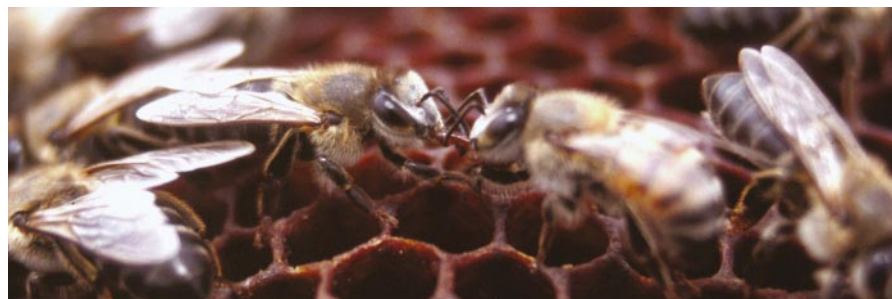
Insect invasion: an African honeybee (right) unwittingly feeds one of an army of parasitic Cape bees.