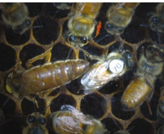
An egg-laying worker bee (marked) is ignored...